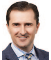
L.P. Gregoire Gowling WLG